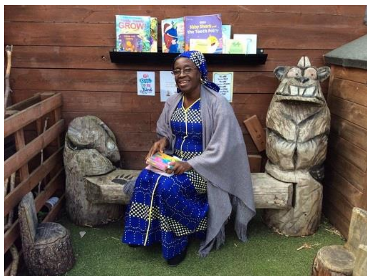
the Gruffalo house