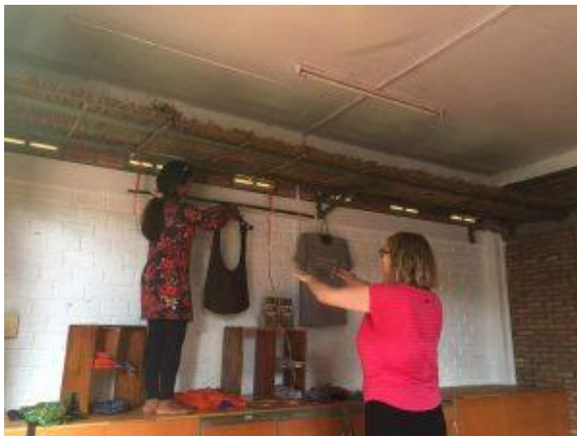
Displaying products made by the sewing group