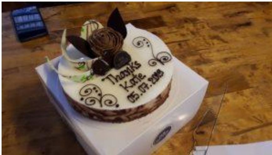
Thank you from the team at Treak

If you have a skill that you could share and would like to immerse yourself in another culture then volunteering abroad is a fabulous experience. Because I was there to do a job that I really enjoyed it kept me going when sometimes other aspects were hard such as getting used to the heat or feeling under the weather! I think it's important to contribute as much as you can whilst you are there. I never felt I had all the answers but the willingness to get alongside your Cambodian colleagues and share with them what you know is really helpful.'